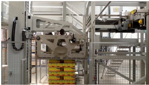
Picture 3: One of the keys to its success is the integration of advanced drive control systems from Mitsubishi Electric, which helps to ensure machines that deliver reliability, flexibility and speed.

Note to Editor: If you would like text in another language please contact Nicola Bigmore at DMA Europa – Nicola@dmaeuropa.com