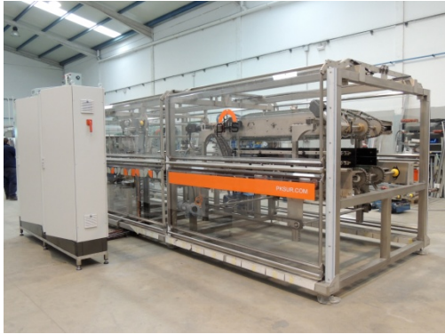
Picture 2: Packaging machine manufacturer PKS develops end-of-line solutions that meet the latest market requirements.